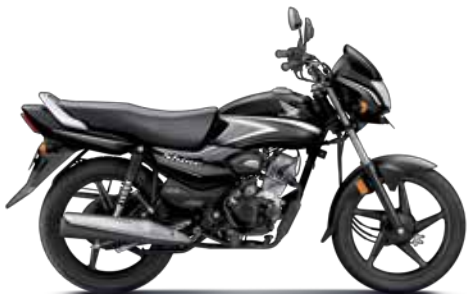
Black With Grey