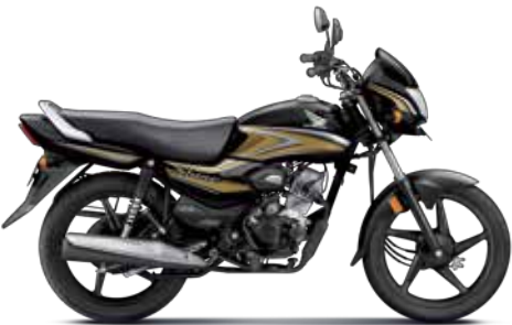
Black With Gold