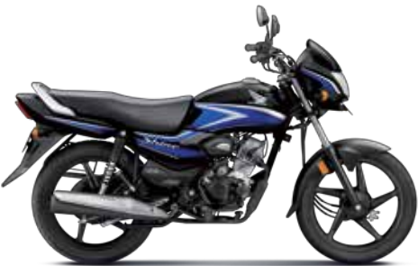
Black With Blue