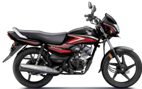
Black With Red