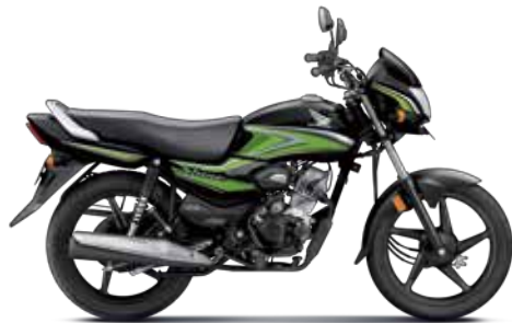
Black With Green